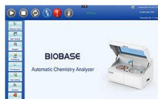
Software User-friendly software.