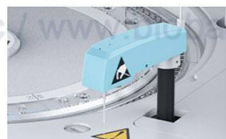
Mixer Probe Teflon coating to avoid cross contamination.