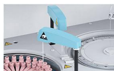
Sample Probe Liquid level sensor function. Anti-collision function. Reagent volume real-time detection.