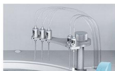
Washing Probe Independent 5-step washing system.