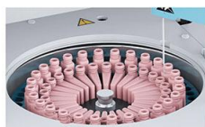
Reagent Tray 2~12°C for 24 hours.